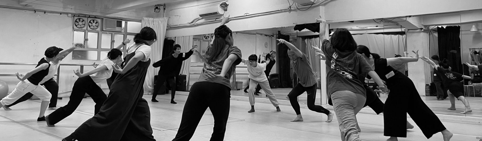
DanceHub 2023 Workshop III "Soul Free".